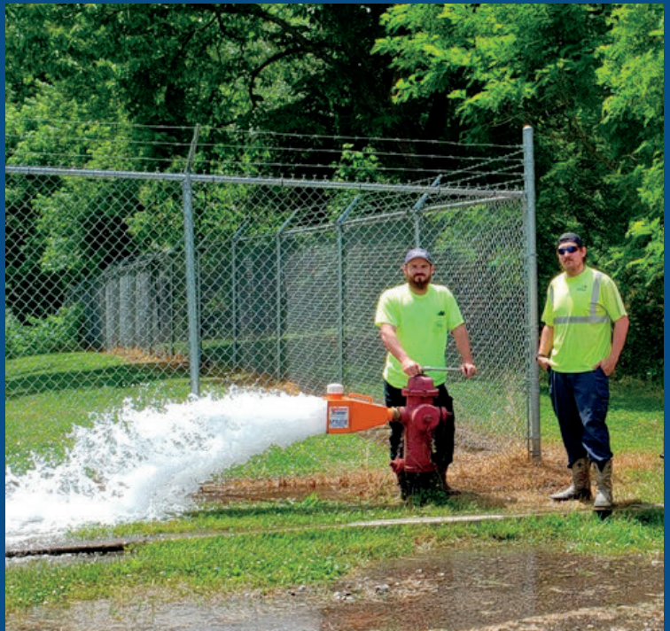
Pictured Right: Water Distribution Crews shown flushing a fire hydrant. This process ensures fresh water pulls into the system and maintains proper disinfection levels. Another benefit is testing the fire hydrants functionality.

The purpose of monitoring for these contaminants is to help EPA determine where the contaminants occur and whether they should have a standard. As our customers, you have a right to know that this data is available. If you are interested in examining the results, please contact our office during normal business hours.