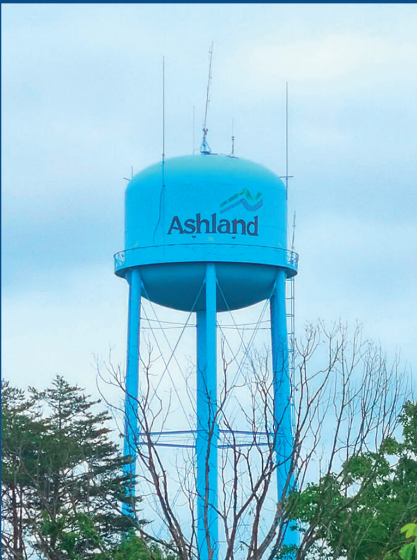
Pictured Left: 250,000 gallon Foothills elevated tank.